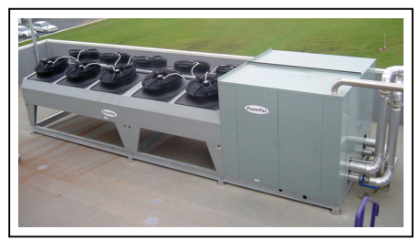
Air Cooled chiller installation

PowerPax chillers are easily interfaced to building management systems and provide easy connectivity with most industry standard protocols.