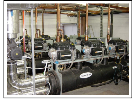
Remote air cooled chillers 800 kW

TURBOCOR compressor redefines softstart, drawing only 2 amps compared to 500-600 amps required by conventional compressors.